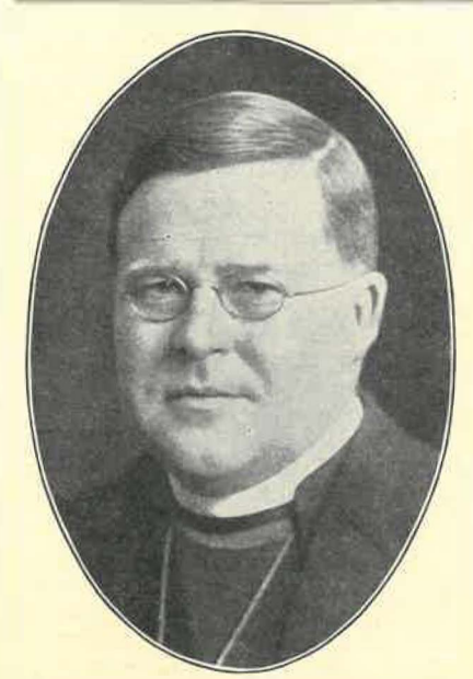
THE ARCHBISHOP OF YORK