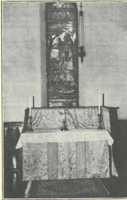
CHAPEL, CHRIST CHURCH, WILLIAMSPORT, PA.