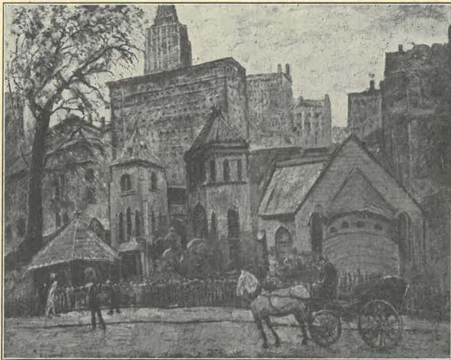
"THE LITTLE CHURCH AROUND THE CORNER"

TRINITY COLLEGE LIBRARY RECEIVED JUL 16 1934 HARTFORD, CONN.