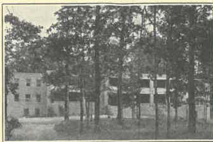
HORNER HALL, APPALACHIAN SCHOOL