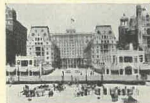
WALTER J. BUZBY, INC.