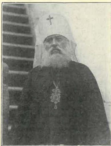
THE LATE METROPOLITAN PLATON