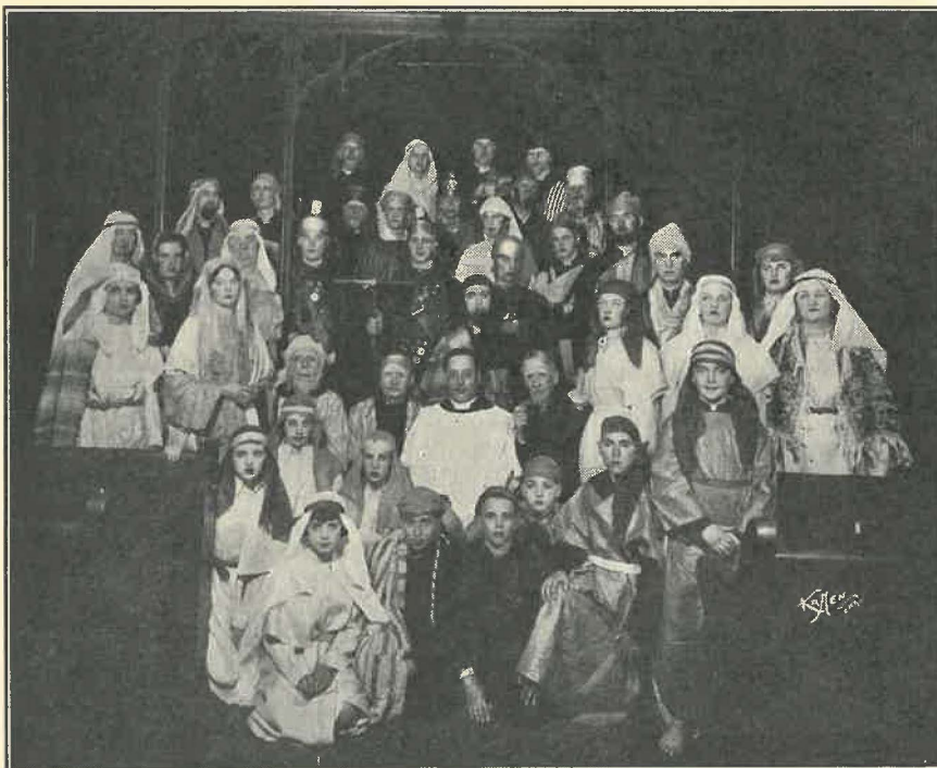
"THE DAWNING"

Pageant of the Easter Gospel presented recently at the Church of the Redeemer, Chicago. Participants were members of the vestry, the choir, and various parish organizations, many of them elderly persons, prominent in Chicago affairs. The pageant was built entirely around the words of the Holy Scripture.