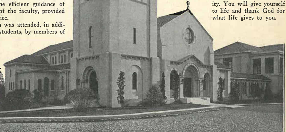
ST. MARGARET'S CHAPEL, TOKYO

more and more in love with living; more fruitful of ideas that will broaden your life and develop your growing personality; more alert to see goodness and beauty everywhere, to understand human beings, and more able to express what life means to you by simple radiation of your personal-