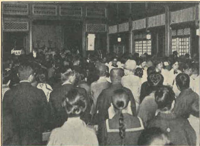
CONSECRATING THE CHURCH