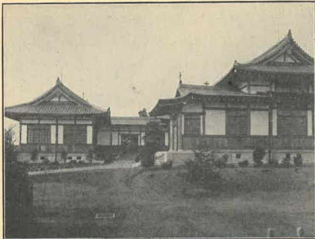
CHRIST CHURCH AND PARISH HOUSE

The ancient Japanese style of architecture has been very beautifully adapted to modern needs in this new church at Nara, Japan.