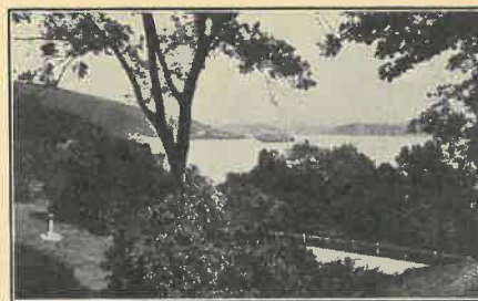
View of the Hudson River from