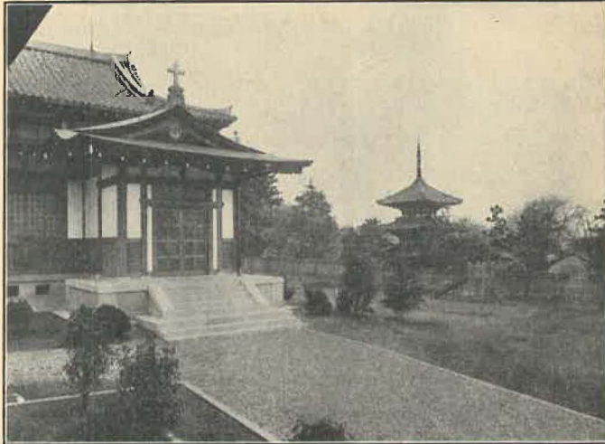
ENTRANCE TO THE CHURCH

The ancient Japanese style of architecture has been very beautifully adapted to modern needs in this new church at Nara, Japan.