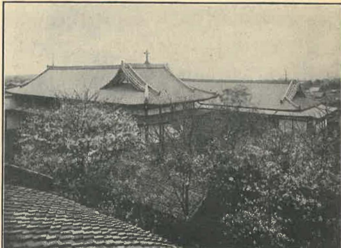
THROUGH THE CHERRY BLOSSOMS

One of the most impressive services ever held in Japan was the consecration of Christ Church, Nara.