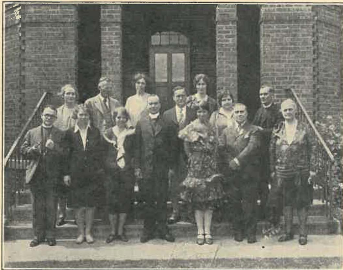
OLYMPIA CONFERENCE STAFF

DELAWARE, N. J.—A young people's conference, sponsored by the diocese of Newark and meeting at Delaware from June 20th to 22d, brought out an attendance