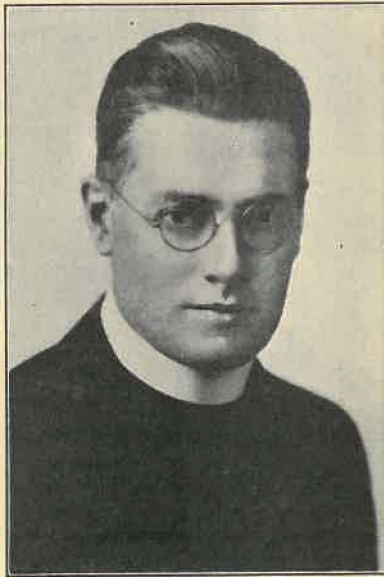
NEW RECTOR OF GRACE CHURCH, OAK PARK, ILL.

PETERSBURG, VA.—The simple record of the closing exercises of the school does not even suggest the heroic services of an able faculty who with an utterly inadequate equipment are forced at every turn to recognize that the Church has given them the task of shaping, and in many cases creating, the character of those who are to be the teachers and examples for the Negro race, and to do this with little hope that the Church will take note