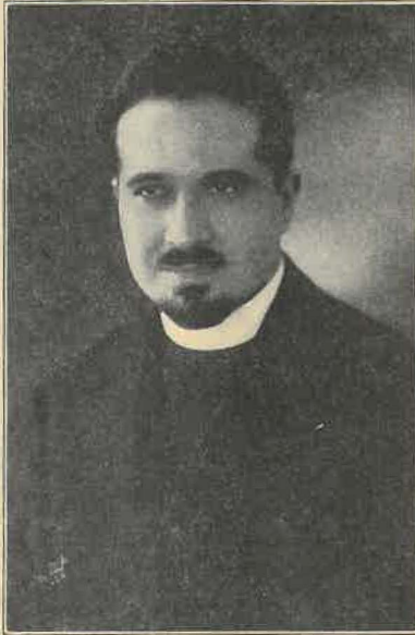
BISHOP-ELECT OF PAPHOS