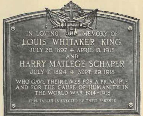
Bronze Memorial Tablet 28x22 — $185

THE SPIRIT OF MISSIONS 281 Fourth Avenue, New York