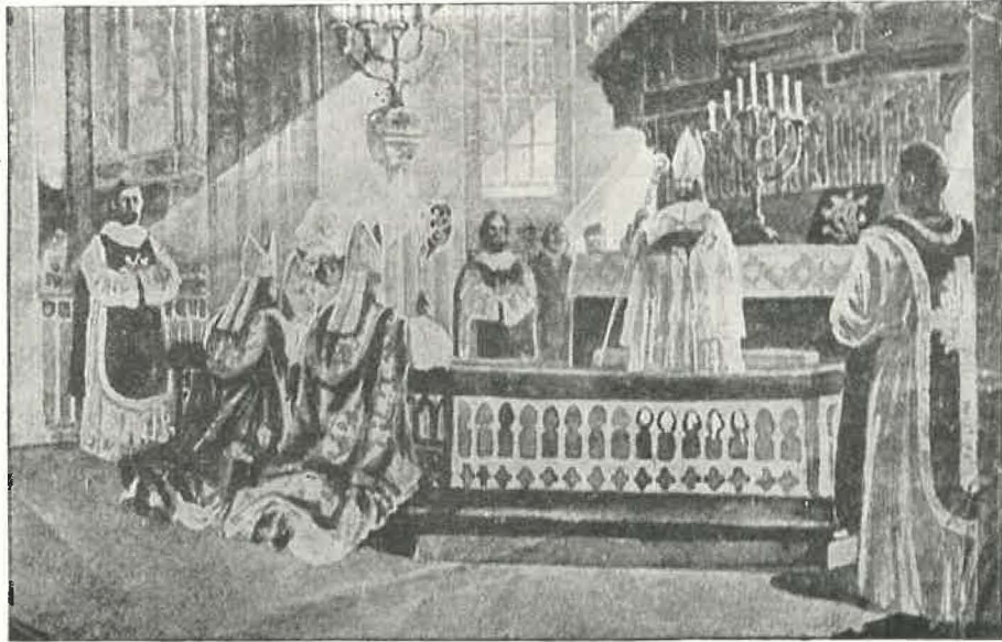
A CONSECRATION OF BISHOPS IN UPSALA, SWEDEN

Secondly, we must lay great stress upon the adequate preparation for Confirmation. The Scandinavian national Churches, while they do not have episcopal Confirmation, make much more of this rite than our American Church seems to do. People who never dream of affiliating with the Church send their children to be prepared for what they understand as Confirmation, and to be confirmed. But the objection we often meet with from the side of Scandinavian parents is that they think the Confirmation in the American Church is "too light". I have been much embarrassed, many times, when rectors of our churches have announced in May that the Bishop would be there in June, and that he hoped many would register and come to two or three lectures, and then be confirmed when the Bishop comes. The Scandinavians cannot, on account of their own bringing up, have any respect for a Church that cares so little for the preparation of its candidates. Any rector in a community where there are many Scandinavians will not only be unable to receive them,