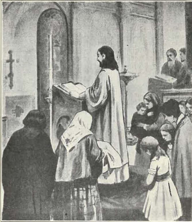
THE HOLY GOSPEL