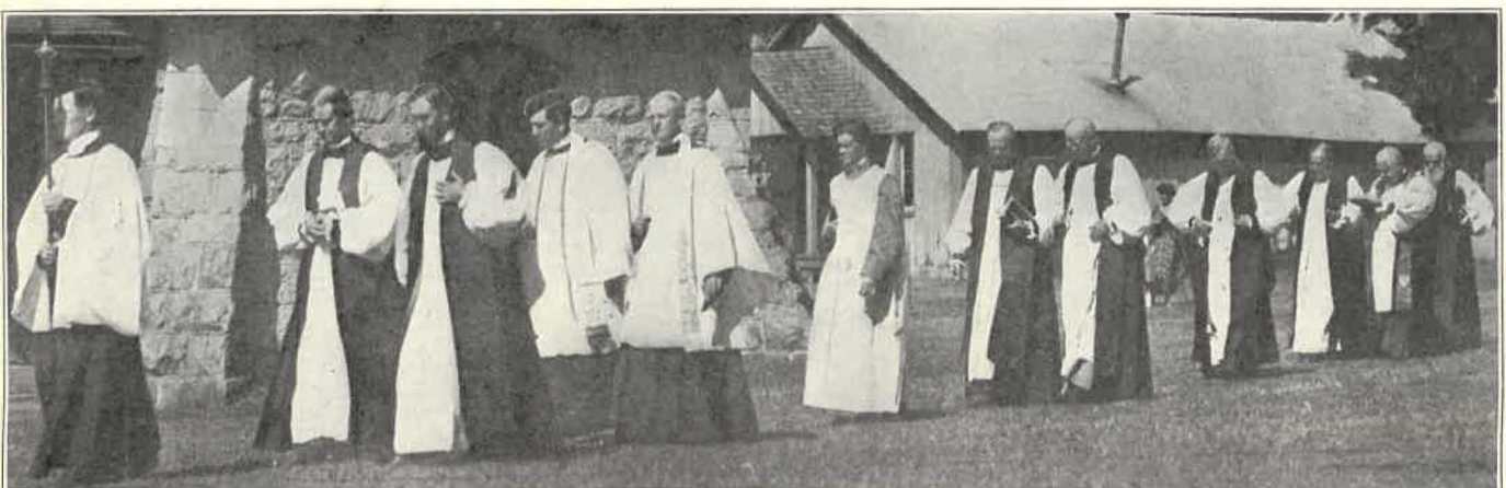
CRUCIFER AND BISHOPS AT THE CONSECRATION OF THE BISHOP OF EASTON, EASTON, MD., SEPTEMBER 15th. (See LIVING CHURCH of September 25th, page 720.)