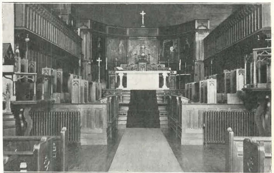
INTERIOR, ST. JAMES' CHURCH, MANITOWOC, WIS.