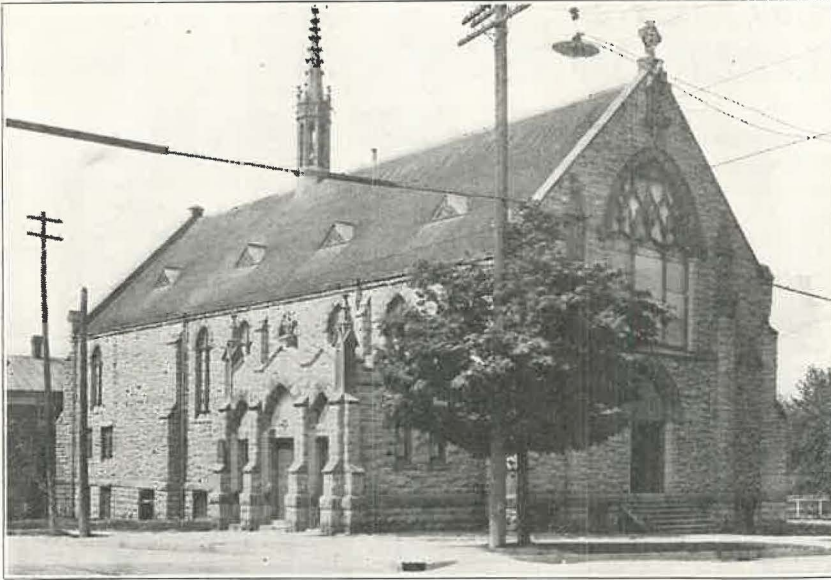
ST. JAMES' CHURCH, MANITOWOC, WIS.