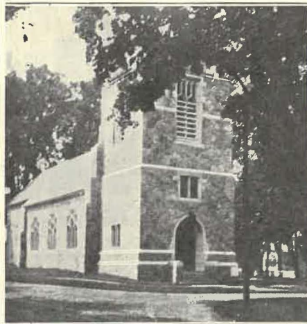
ST. JAMES' CHURCH, WOODSTOCK, VT.