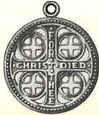
THE CHURCH WAR CROSS