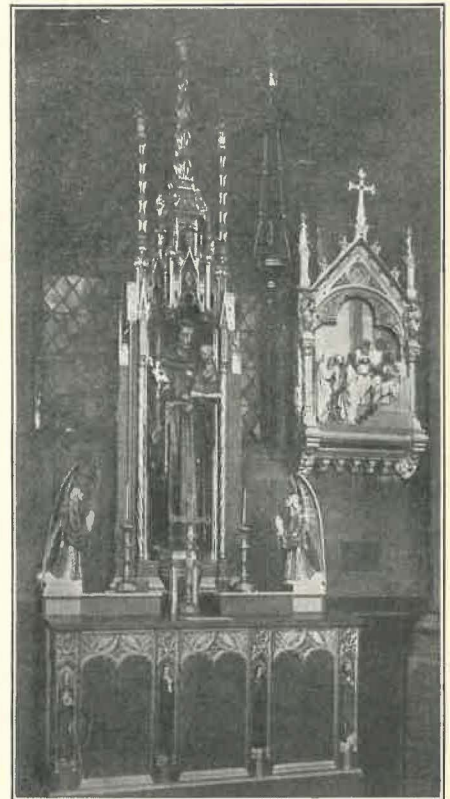
NEW ALTAR IN CHAPEL OF ST. ANTHONY OF PADUA