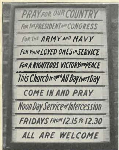
SIGN BEFORE AN OPEN CHURCH

THE CHURCH that is always open ministers to a recognized need. St. Paul's Church, Peoria, Ill., is doing that, and holds a weekly intercession service adapted to the