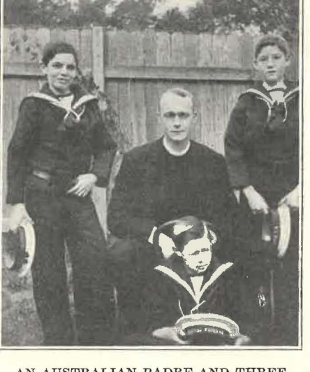
AN AUSTRALIAN PADRE AND THREE OF HIS SAILOR LADS

A GOOD LAYMAN from Ohio faults me for saying the other day that the Union Jack and the Stars and Stripes were one in my heart as in my button-hole, and suggests that we are one with Japan and China as truly. It was a metaphor, of course; but I am quite prepared to defend it pro hac vice. Everyone to his taste; and if my unknown correspondent wants to unify himself with Afghanistan, or Sarawak, he may. But my taste (if one puts it on that ground) prefers the democracy from which we drew our own ideals of freedom and order, and which is now maintaining those ideals in arms.