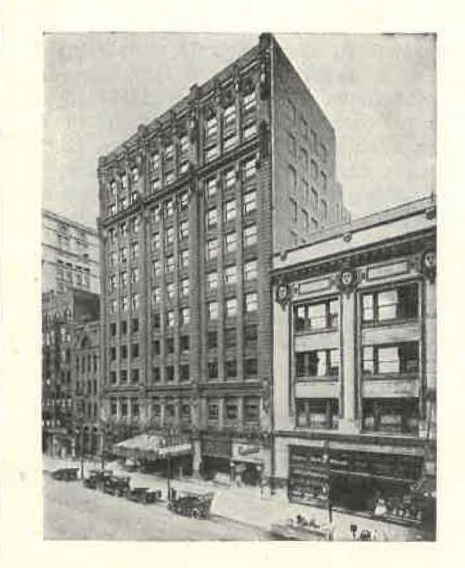
KEITH'S HIPPODROME, CLEVELAND, OHIO Where the mass meeting will be held

The next four days will be replete with events such as are of value to every Church-