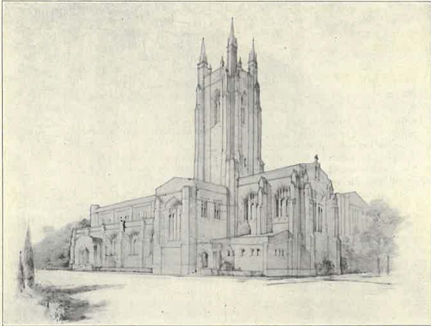
THE PROPOSED CHAPEL OF THE MEDIATOR, PHILADELPHIA