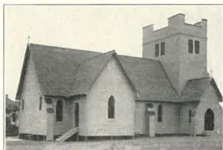
ST. MATTHEW'S CHURCH Kenedy, Texas