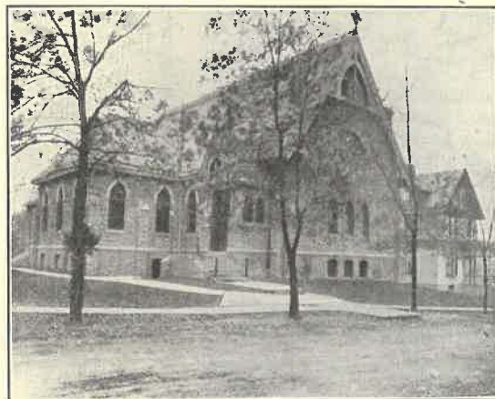
THE CHURCH OF OUR SAVIOUR Cincinnati, Ohio