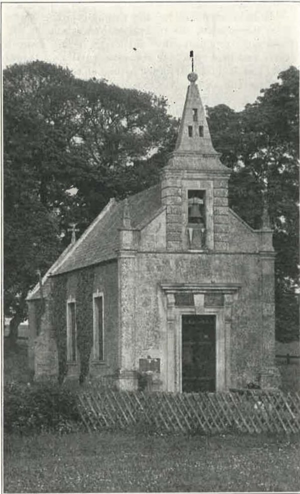
LITTLE GIDDING CHURCH

Looking out for a suitable place of retirement from Lon-