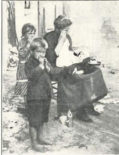
The Innocent Sufferers.

A wave of fire over Europe more terrible, more devastating, than the eruption of a Volcano has robbed thousands upon thousands of Mothers and little children of their natural protectors, and of their homes.