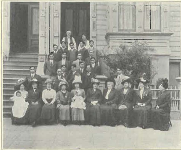
JAPANESE MISSION, SAN FRANCISCO

Now, I ask you for your sympathy and help, my dear readers. Please remember our Church work in your prayers.