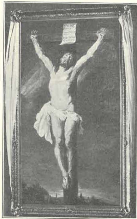
THE CRUCIFIXION. (Isydoras Stoll.) From painting in Chapel of St. Cornelius, Governor's Island.

The latest addition to the sacred pictures of the chapel is con-