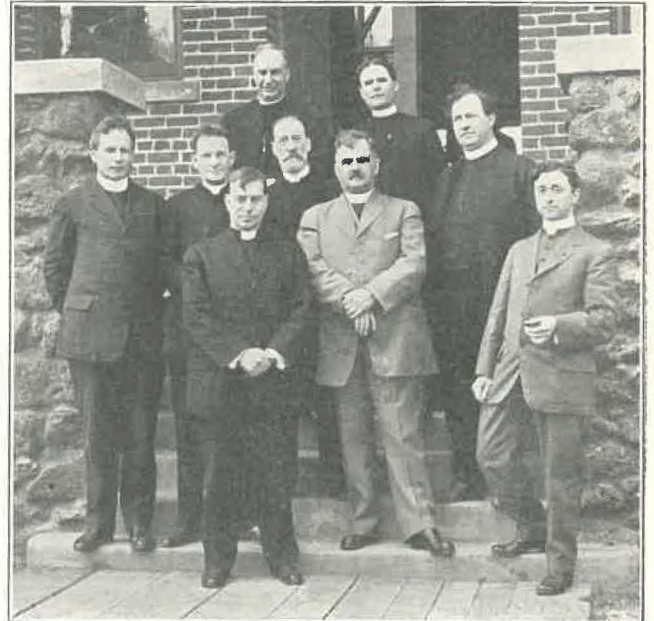
CLERGY AT EASTERN OREGON CONVOCATION

Bishop Paddock formally opened the House of Churchwomen, which is modelled upon the organization of that name in the diocese of California, and which will take the place of the women's meetings