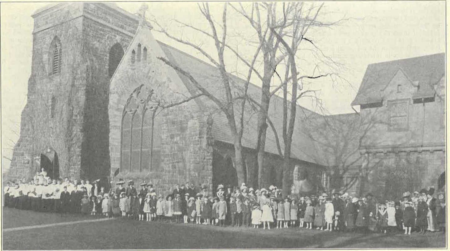
CHURCH OF THE ATONEMENT AND PARISH HOUSE, CHICAGO.