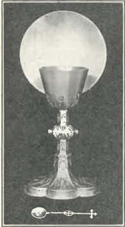
MEMORIAL CHALICE AND PATEN, ST. SIMON'S CHURCH, CHICAGO