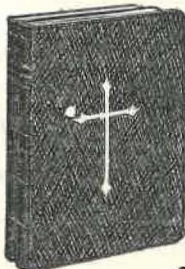
No. 1100X. Price $2.75