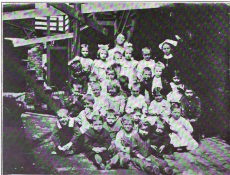
A GROUP FROM THE KINDERGARTEN.

The day nursery—a boon to mothers who must go out to the wash tub or other work to provide the wherewithal to feed and clothe the young brood—is patronized to its full extent. Here the women leave their babies, paying five cents a day for the privilege; and connected with the nursery is the roof garden, a joy for all the children of the tenement. Each family has its