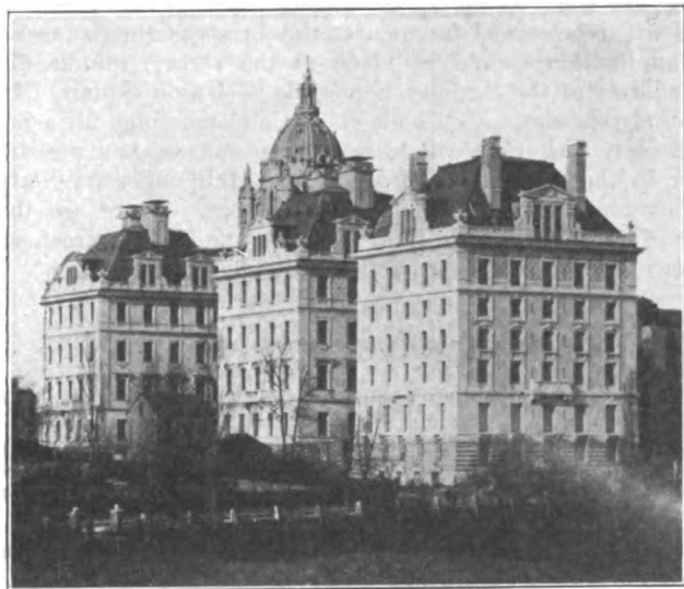
ST. LUKE'S HOSPITAL, NEW YORK CITY.

One of the largest and best-appointed pavilions for private patients possessed by any hospital in the city was formally opened on St. Luke's day by the Bishop Coadjutor, on the