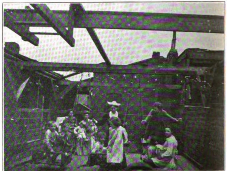
ROOF GARDEN—SCENE II.