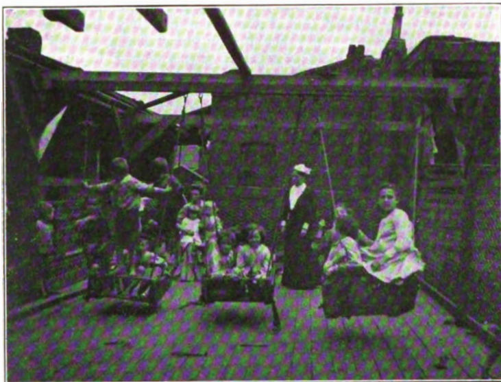
ROOF GARDEN—SCENE I.

dispensary, gives one hour from each of his busy days to caring for the needs of all who come to him: medical attendance free for all, and medicine free for those too poor to pay the few cents asked from those who can pay. In this noble work, Dr.