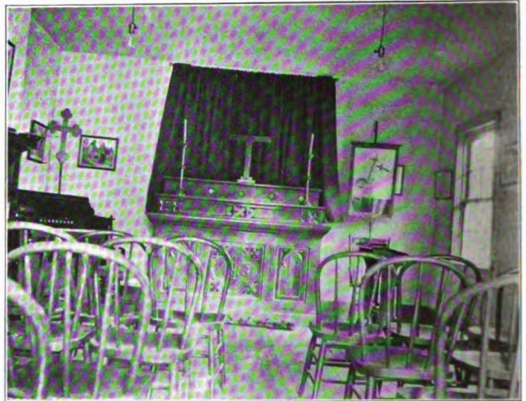
HOLY CROSS MISSION CHAPEL, ST. LOUIS.

As we enter the arched gateway to the narrow alley we see,