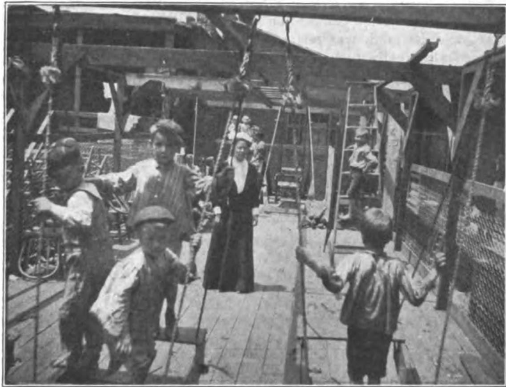
ROOF GARDEN—SCENE III.—HOLY CROSS MISSION.

On Saturdays, a bath room, fitted with tub and shower