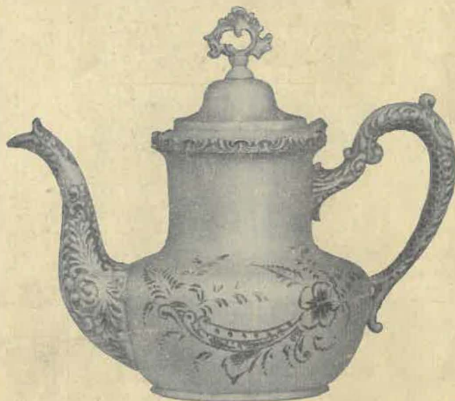
No. 86 Tea Pot. Separate, price $2.25 delivered free.

Quadruple Silver Plate Satin Engraved Very handsome and very cheap at this SPECIAL SALE