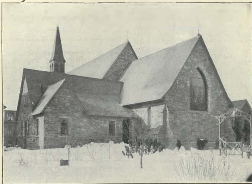
ST. MICHAEL'S CHURCH, GERMANTOWN, PA.

one of the earlier German hymnals, " Turtel Taule ," meaning turtle dove , from a mystical connection of that bird with the tragedy of the crucifixion, at which time it was said to have witnessed the agony of our Lord, and alighting on the cross, sadly sighed: "Kyrie! Kyrie! Kyrie!" Another custom of these people at funerals was to chant the De Profundis . It is a cause for congratulation, therefore, that St. Michael's, in many remarkable ways, stands on the ground once so used by these hermits of the Wissahickon, and in the chancel of which is this tablet: