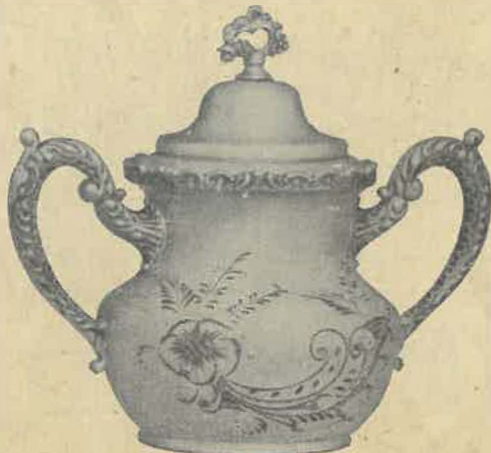
No. 86. Sugar Bowl. Separate, price $1.75 delivered free