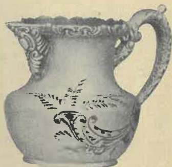
No. 86 Creamer (Gold lined). Separate, price $1.65 delivered free

The RELIANCE Mfg. Co. refer by permission, as to their reliability and standing, to The YOUNG CHURCHMAN CO., Milwaukee.