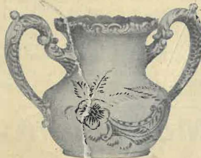
No. 86 Spoon Holder. Separate, price $1.65 delivered free.

RELIANCE MANUFACTURING CO., - 699 German