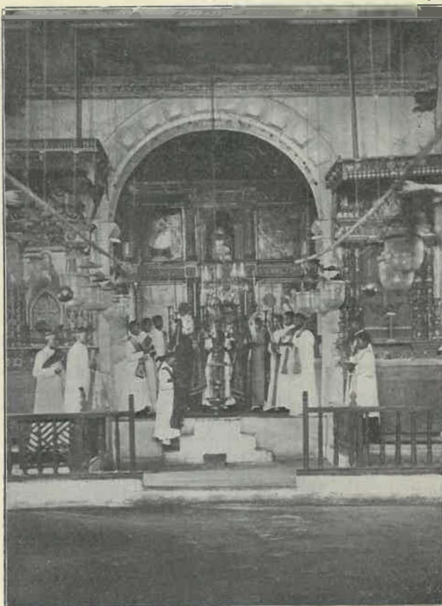
THE PROCESSION INTRODUCTORY TO HOLY COMMUNION. OLD SYRIAN CHURCH, KOTTAYAM, SOUTH INDIA.