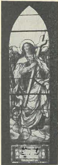
MEMORIAL WINDOW, ST. MATTHEW'S CHURCH, NEW YORK.