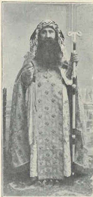
SYRIAN BISHOP IN VESTMENTS.

of the child, so as to wash its whole body. In the case of the Holy Eucharist, it is believed that it is as much a memorial of our Lord's oblation on the Cross as it is an unbloody sacrifice offered for the remission of sins for the living as well as the dead. Transubstantiation has no equivalent word in the Syriac language, and, as far as I know, it has no place in the Syrian liturgy and theological books in the sense in which it is defined by the Council of Trent. But the doctrine of the Real Presence is fully acknowledged. Communion at least three times in a year is insisted upon. The laity is admitted to Communion in the Cup also, though the elements are not communicated separately. In the course of the celebration, the consecrated bread is dipped in the consecrated wine and particles thus dipped are communicated. The Syrians have no objection to Communion in two kinds separately, as administered in the Church of England. But they strongly object to such Communion in the Holy Eucharist celebrated according to the Syrian liturgy. In the celebration, both the death and the resurrection of our Lord are commemorated with special prayers and rituals. The bread