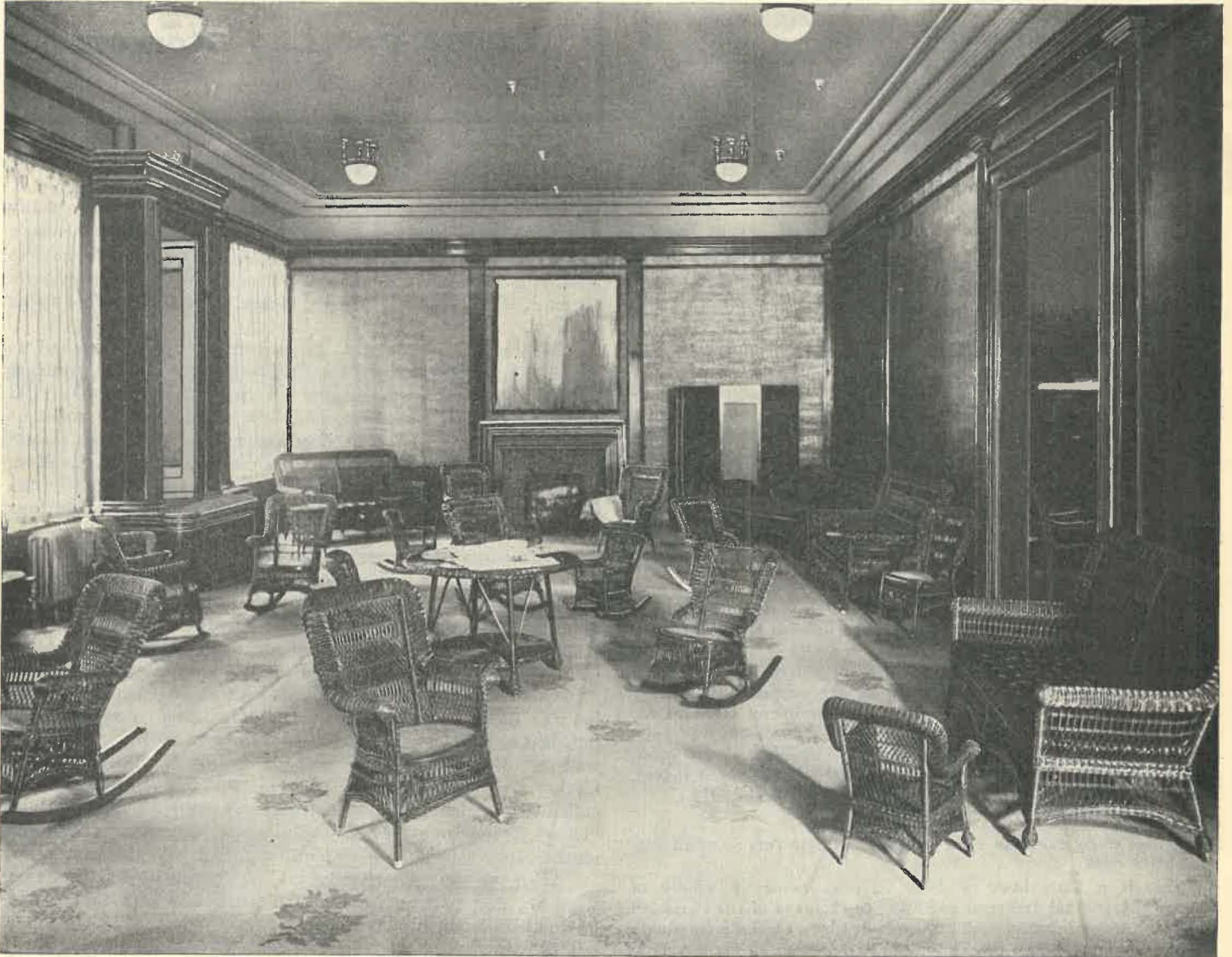
THE "REST ROOM," MARSHALL FIELD & CO., CHICAGO.

The workshop, then, is the point of contact between the two principles—those of Christian ethics and of commercialism. There those principles may best be studied; and it is much to our discredit that there are so few business houses where these may be studied under really favorable auspices.