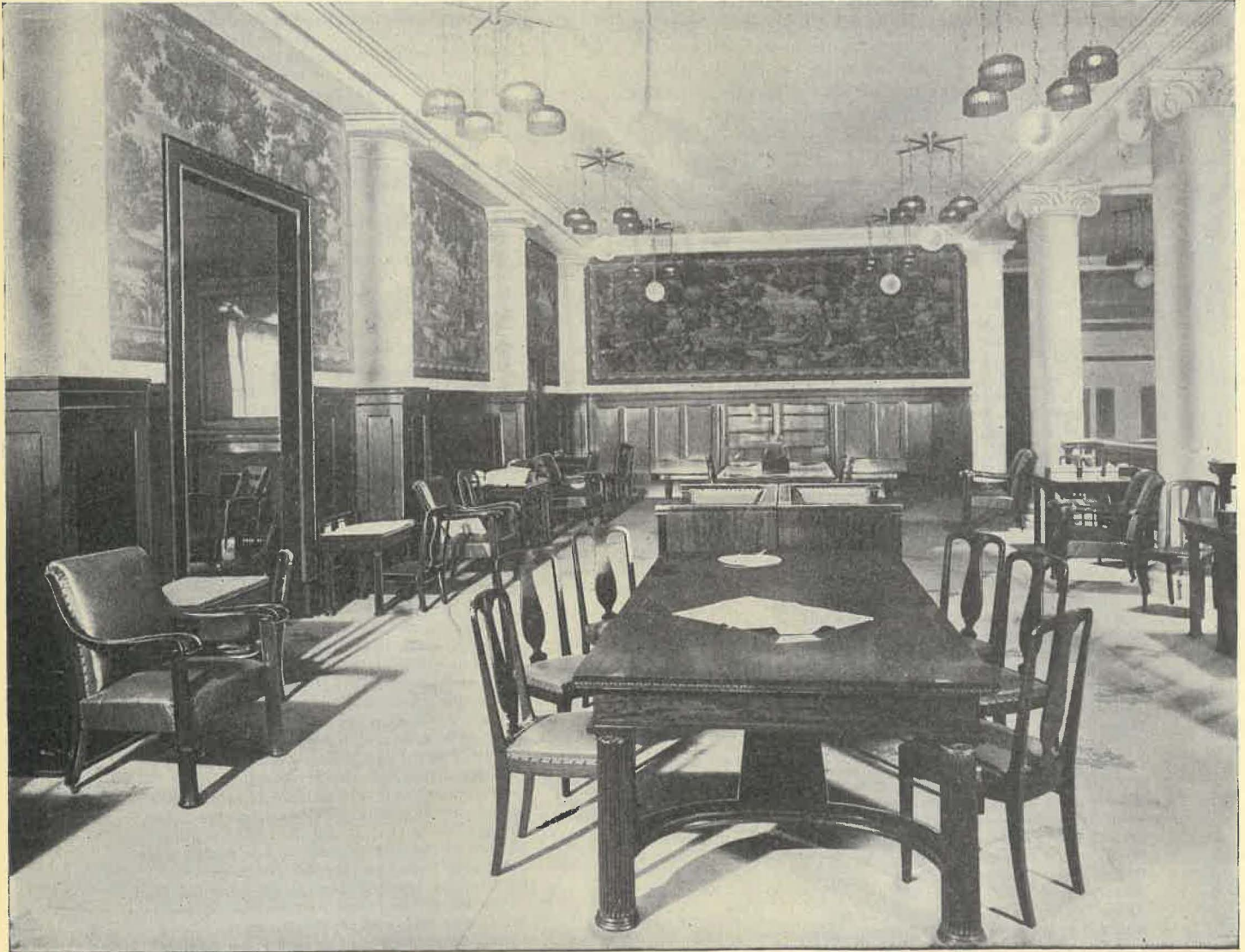
THE WRITING ROOM, MARSHALL FIELD & CO., CHICAGO.

But all these specifications, after all, deal with externals. Better than any of them is the care and the interest which binds the whole community together. There is, in the first place, inquiry into the character of persons received into employment. It is intended that only those of virtuous life shall be admitted into fellowship. But after that, there is every effort made to convince each that the whole force, employers and employees, are working together for the common good. And this common good is not the one-sided affair we so frequently see. The