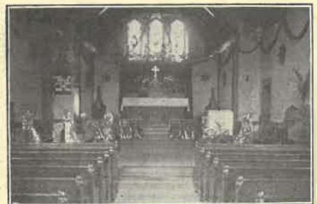
ST. PAUL'S CHURCH, BUTTE, MONT.