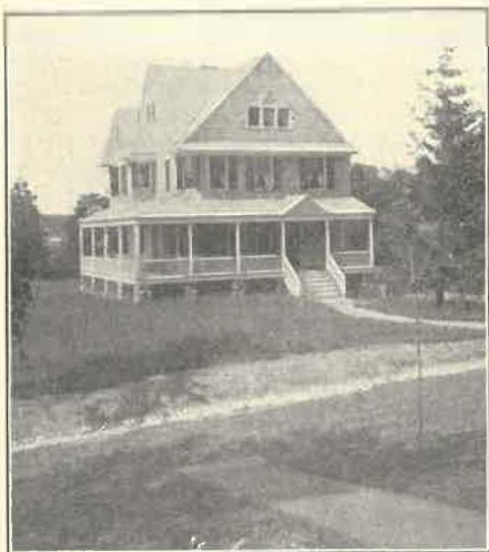
ST. PAUL'S RECTORY, RIVERSIDE, CONN.

ST. PAUL'S, Riverside, has seen many improvements during the rectorship of the