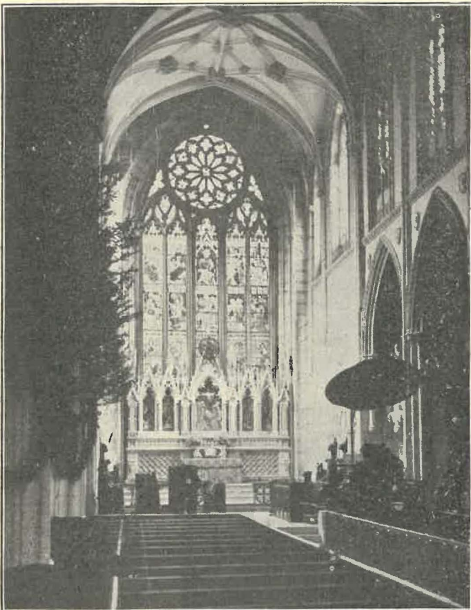
NEW CHANCEL, GRACE CHURCH.