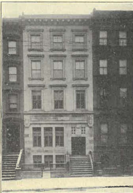
DIOCESAN HOUSE, BROOKLYN.