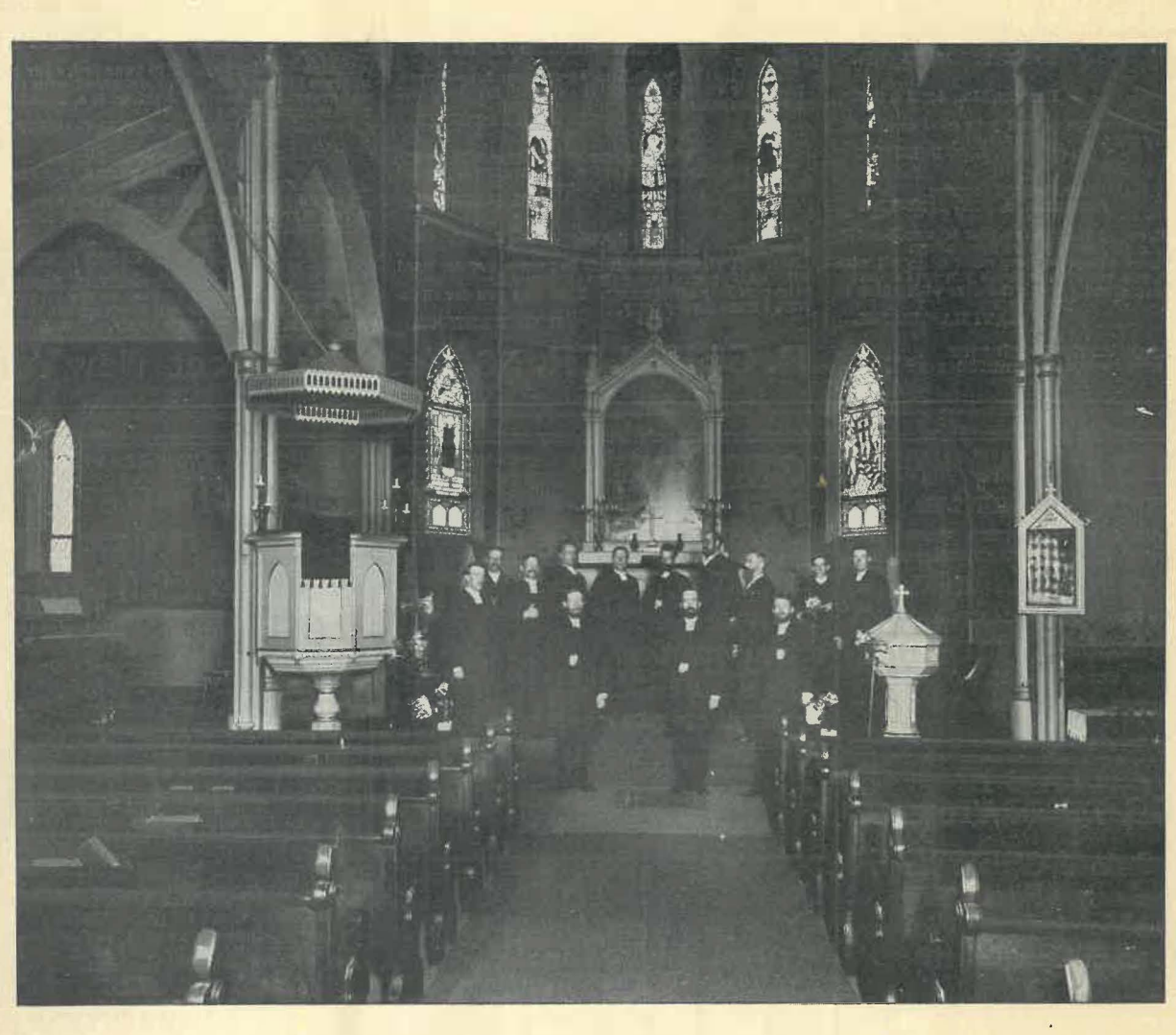
THE SWEDISH CHURCH ASSOCIATION In Session at St. Ansgarius' Church, Chicago, April 12-17, 1899

A Weekly Record of Its News, Its Work, and Its Thought