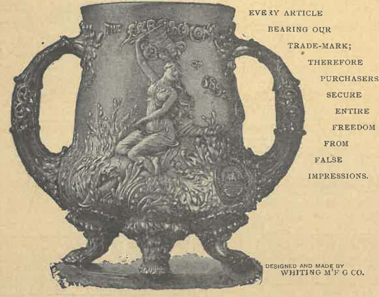
LARCHMONT CUP FOR SCHOONERS, WON BY "IROQUOIS."