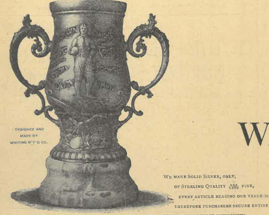
THE "BROOKLYN DAILY EAGLE" FOOT BALL TROPHY.